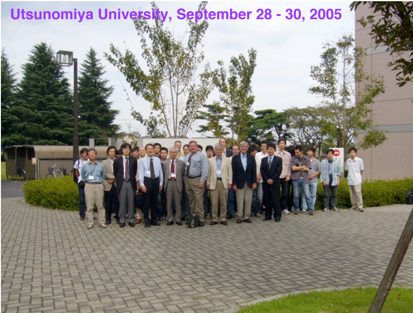
Utsunomiya University, September 28 - 30, 2005