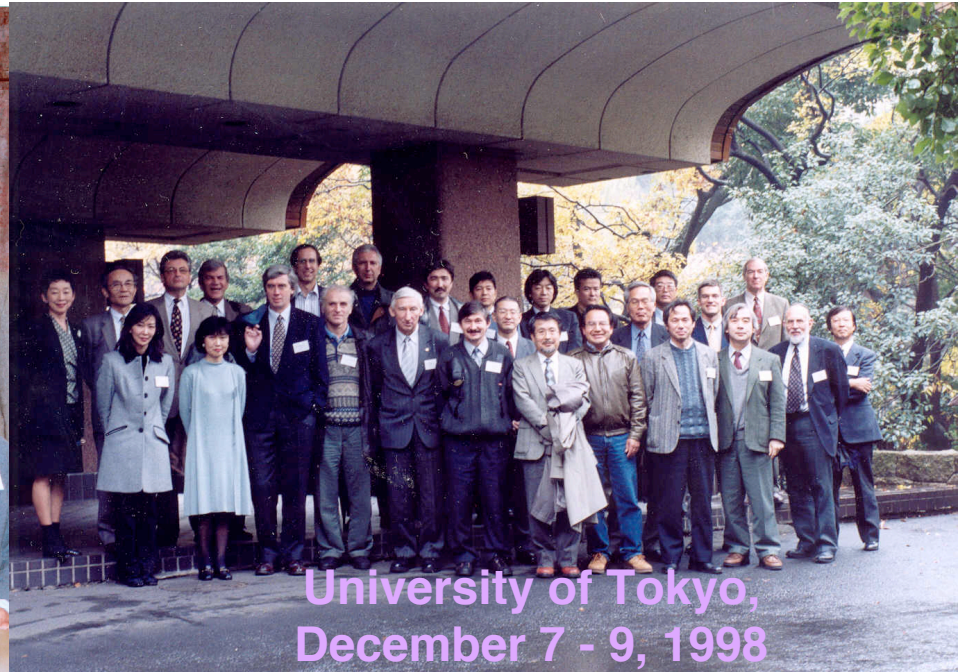
University of Tokyo, December 7 - 9, 1998