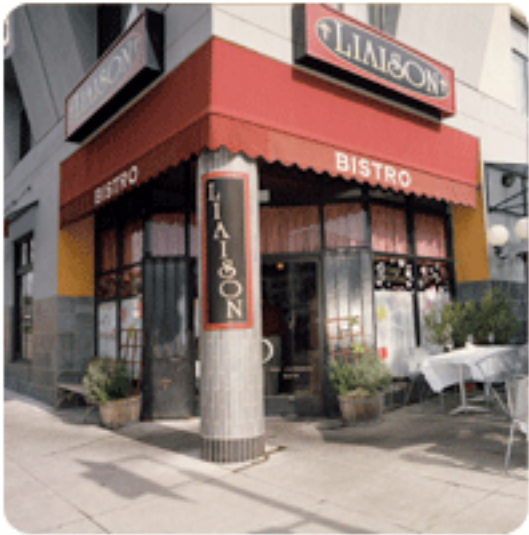
1849 Shattuck Avenue (at Hearst) Berkeley, California 94709