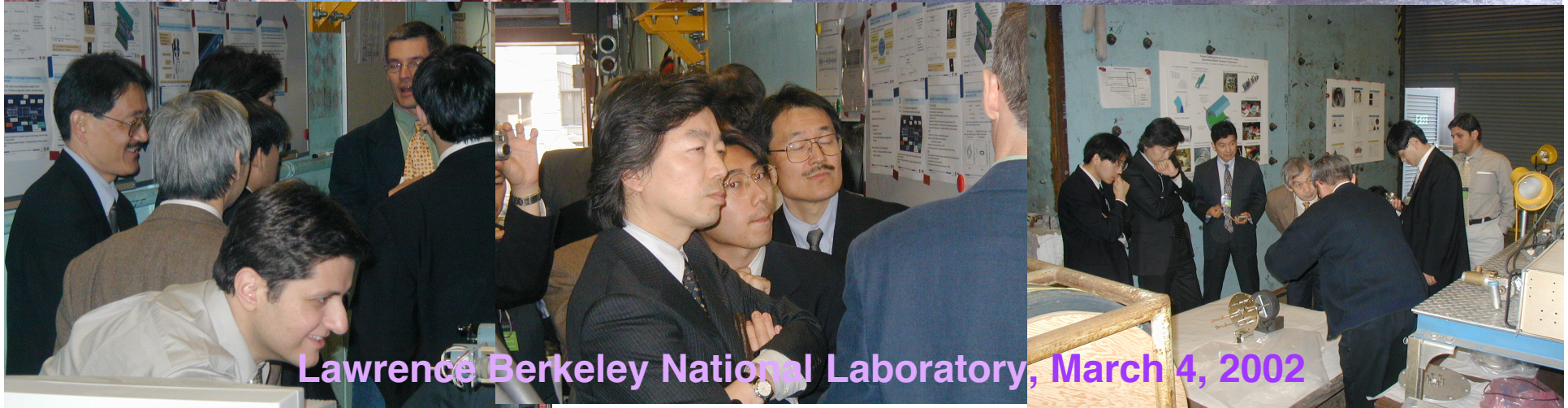
Lawrence Berkeley National Laboratory, March 4, 2002